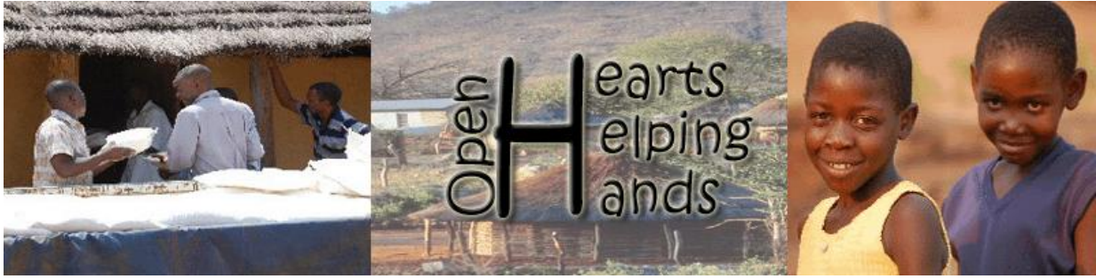
Food Distribution at Chipendeke church of Christ 9/20/21